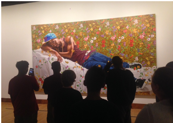
OCJB youth admire the work of artist Kehinde Wiley during a tour of the Oklahoma City Museum of Art in July, 2017.

Careers: Ready to begin a rewarding career in a position where you can make an impact? Visit our website to view available positions or call our Human Resources department at (405) 713-6438 for more information.